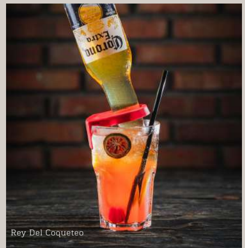
Rey Del Coqueteo