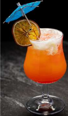
Mar Del Plata

PANTHERA ROSSA 65 Lychee syrup, peach syrup, cherry fruits, fresh milk, cherry water