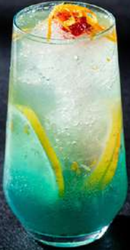
Fly Me To The Moon

FLY ME TO THE MOON 65 Blue curacao syrup, green apple syrup, lemon juice, apple juice, raspberry jam top up carbonated and orange peels