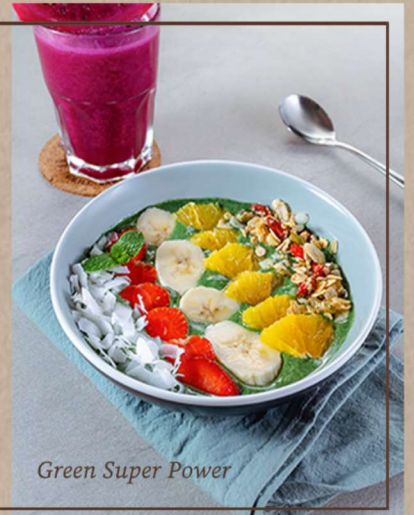
Green Super Power

GREEN SUPER POWER IDR 90 Banana, spinach, spirulina, matcha, coconut milk, strawberry, orange, granola, chia seeds and coconut flakes