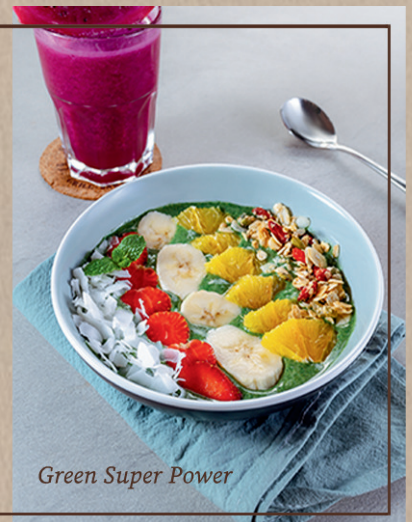
Green Super Power